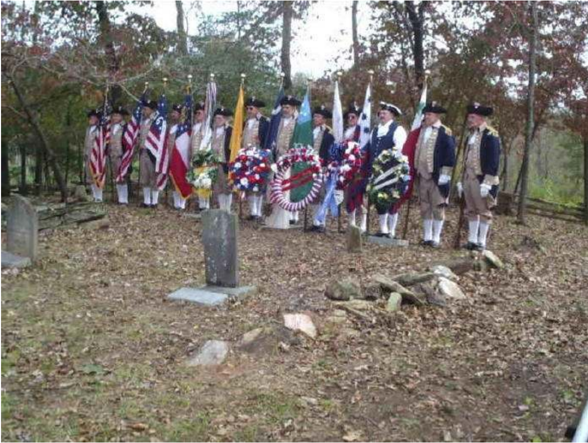
Grave dedication for Howard Cash October 25, 2003