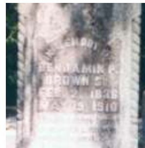
The Brown Plot