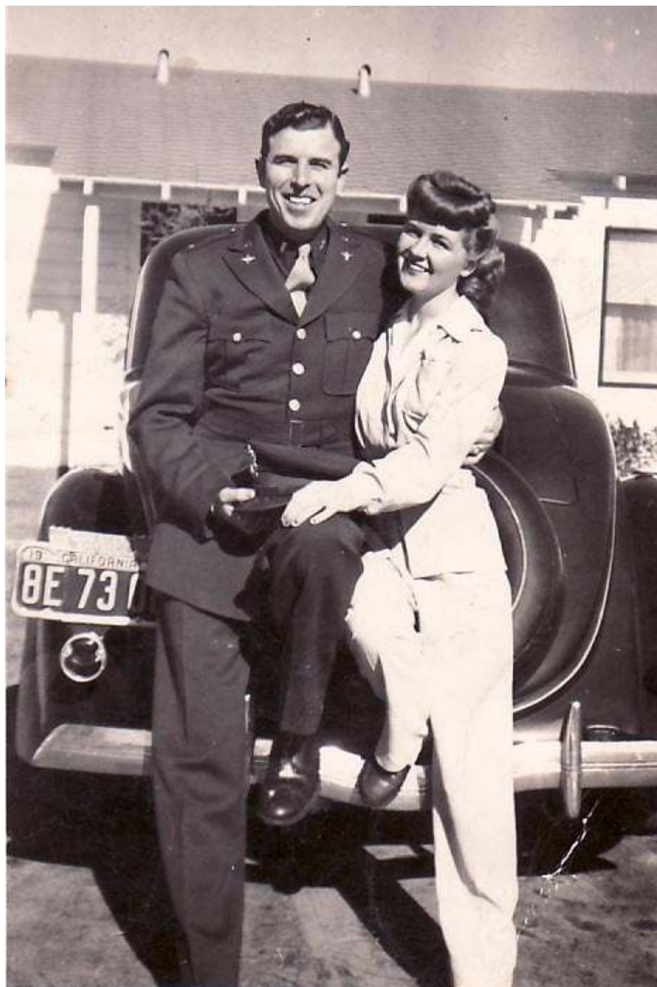
After marriage, while stationed in California