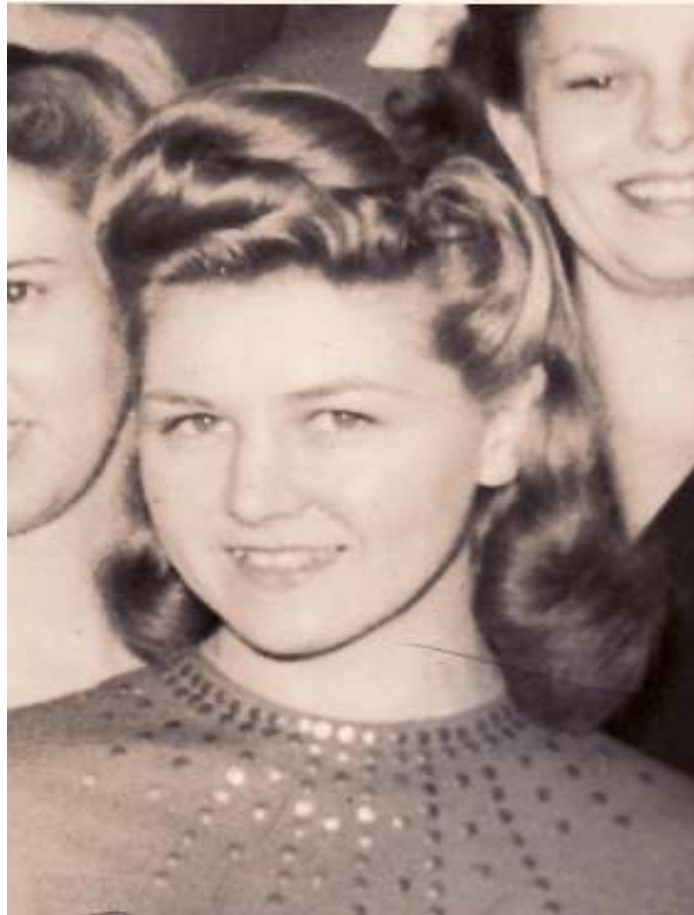
High School Photo