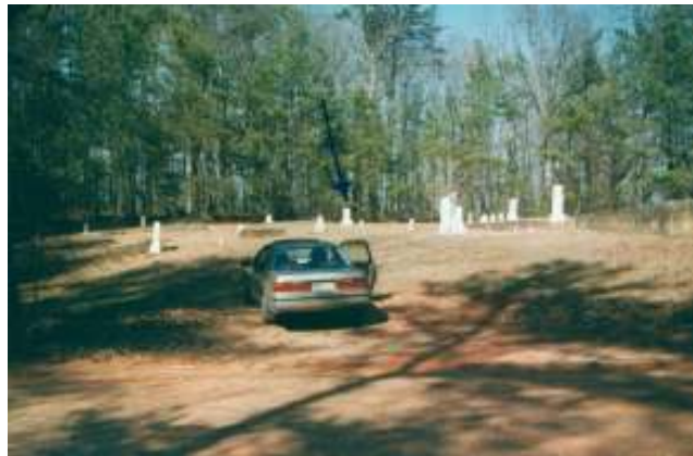
Mt. Grove Cemetery